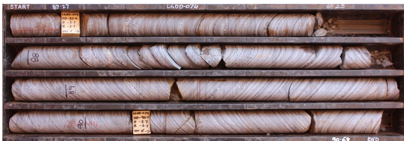
Photo 1 - Strong magnetite mineralisation at Moonshine North Zone in diamond drill hole LGDD_074