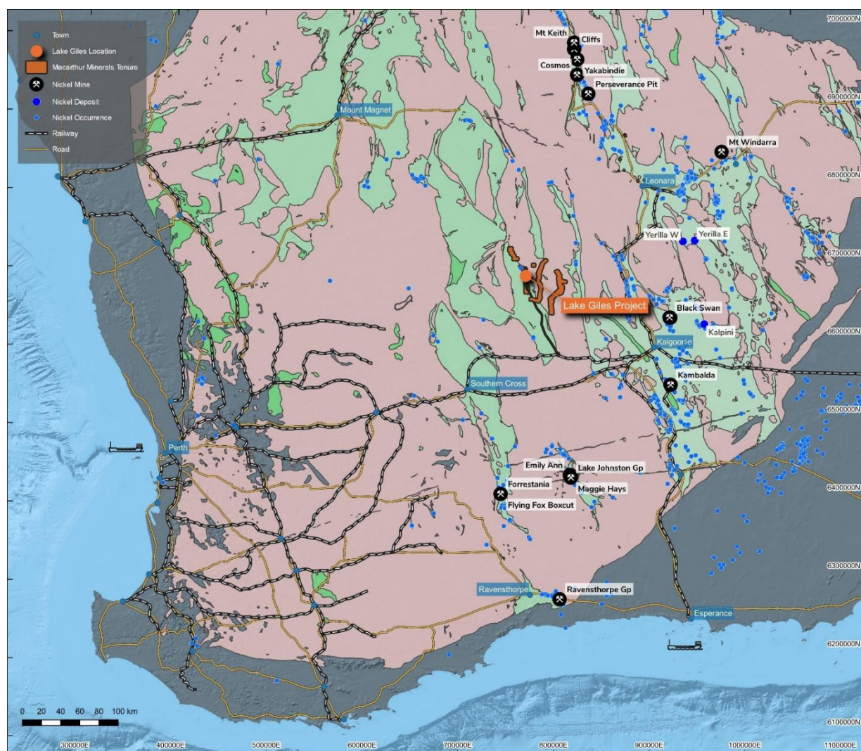
Figure 2: Lake Giles Project Location

The Project is owned by Macarthur Iron Ore Pty Ltd, a 100% owned subsidiary of Macarthur Minerals Limited ("Macarthur" or "the Company").